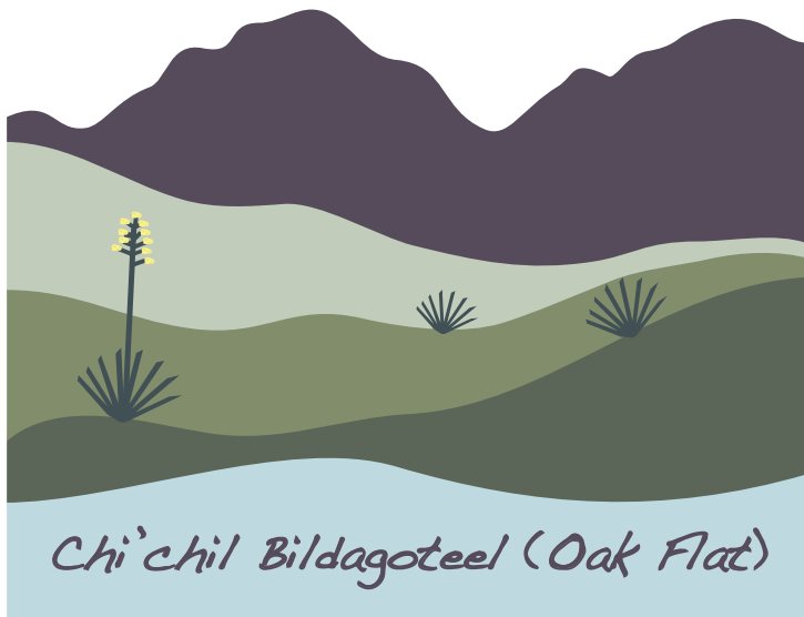
Chi'chil Bildagoteel (Oak Flat)