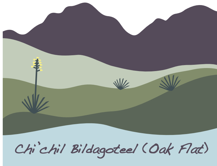
Chi'chil Bildagoteel (Oak Flat)